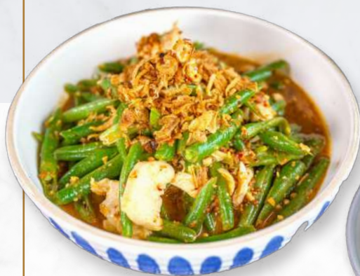
THAI SPECIAL SALAD

27. YUM PLA $21.95 Deep-fried whole trout topped with lettuce, cucumbers, red and green onions, tomatoes, and mint leaves in spicy limejuice