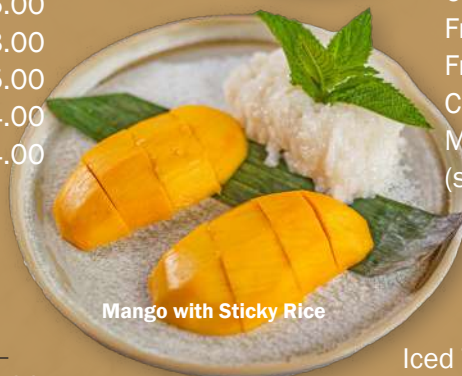
Mango with Sticky Rice