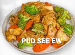
PUD SEE EW

65. PUD THAI $14.95 Pan fried thin rice noodles with egg, bean sprouts, topped with carrots, ground peanuts, and onions