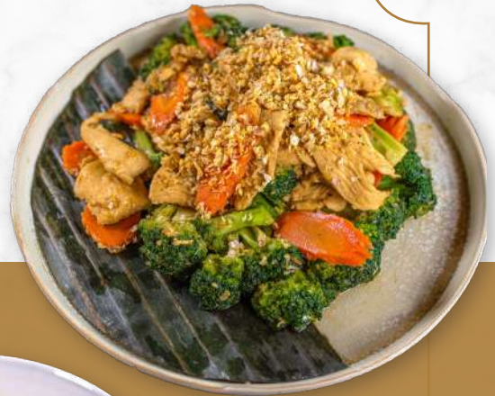
GARLIC & PEPPER

33. GARDEN DELIGHT $14.95 A combination of broccoli, carrot, onions, cabbage, spinach, mushrooms, celery, bell peppers, baby corn, and clear noodles sautéed