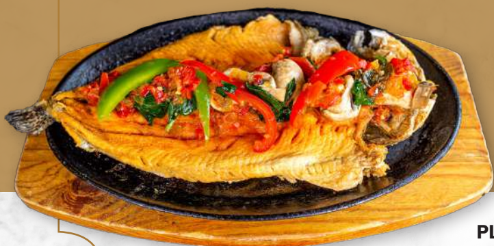
PLA RAD PRIK

64. SIZZLING SEAFOOD $19.95 A combination of prawns, squid, and scallops in a spicy sauce served on a sizzling platter