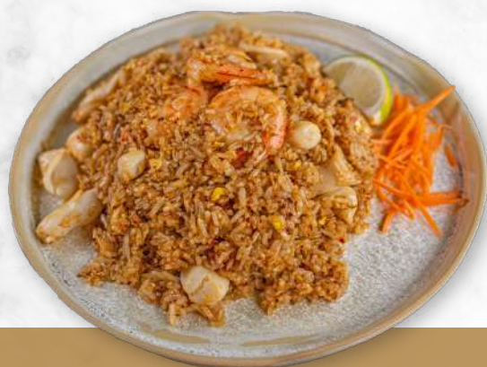
SPICY SEAFOOD FRIED RICE

84. BASIL FRIED RICE $15.95 Your choice of meat fried rice stir fried with basil, onions, mushroom, egg, and bell peppers