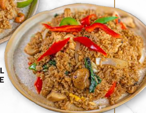
BASIL FRIED RICE