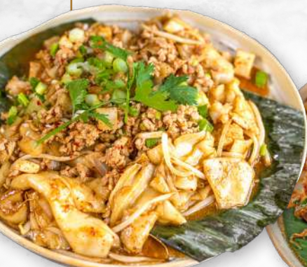
GUAY TIEW LORD

74. THAI SUKIYAKI $16.95 Stir fried clear noodles with Napa cabbage, spinach, green onions, egg, prawns, squid, and chicken served with spicy sukiyaki sauce