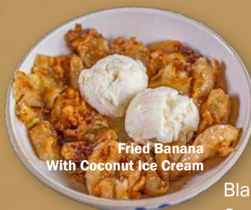
Fried Banana With Coconut Ice Cream