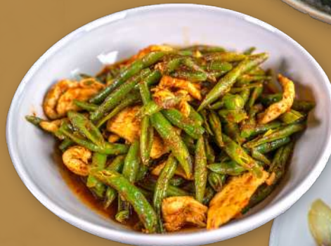
PAD PRIK KING